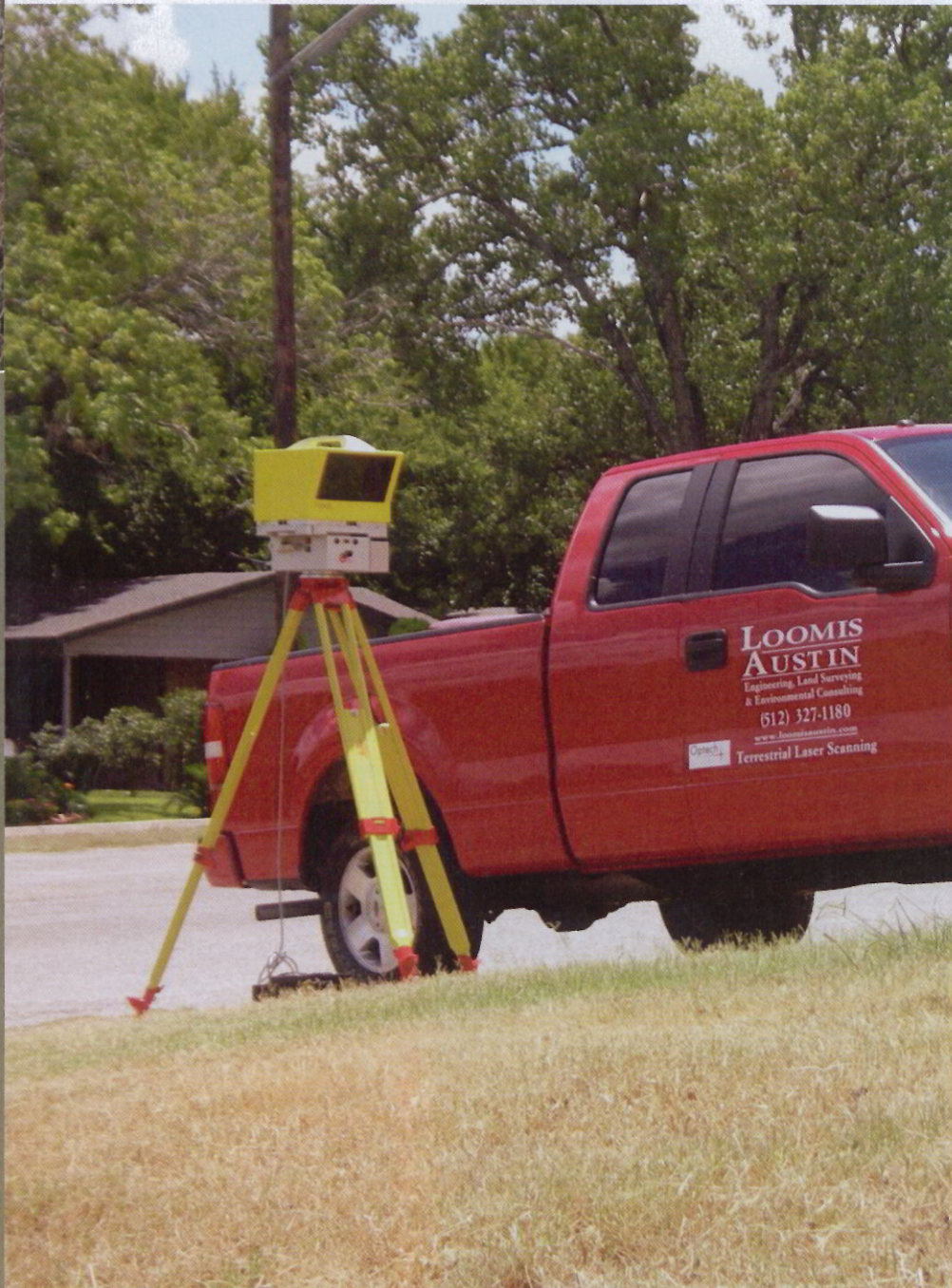
Figure 1 ILRIS-3D Lidar scanner on tripod

Loomis Austin, Inc., a land surveying, engineering, and environmental consulting firm in Austin, Texas, owns and operates an Optech Intelligent Laser Ranging Imaging System (ILRIS-3D) (Figure 1). ILRIS collects